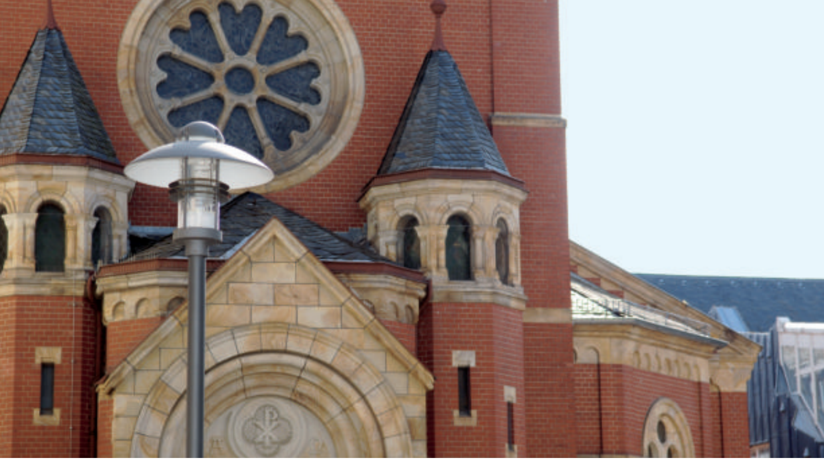
Mainz . Germany Mainz . Germany