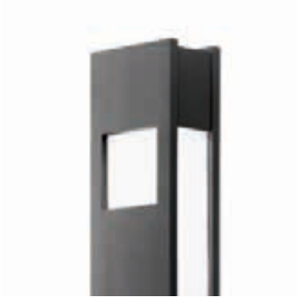
RENO . Illuminating Column / Bollard

RENO's linear form adds a simple accent to contemporary architecture. Rectangular column and bollard are fabricated from aluminum extrusions and panels. Top mounted light source allows easy access and increased efficiency. Matte acrylic lenses generate softly diffused illumination, while effectively highlighting the profile. All hardware is stainless steel. Standard colors: matte silver grey metallic or graphite grey. Special colors available.