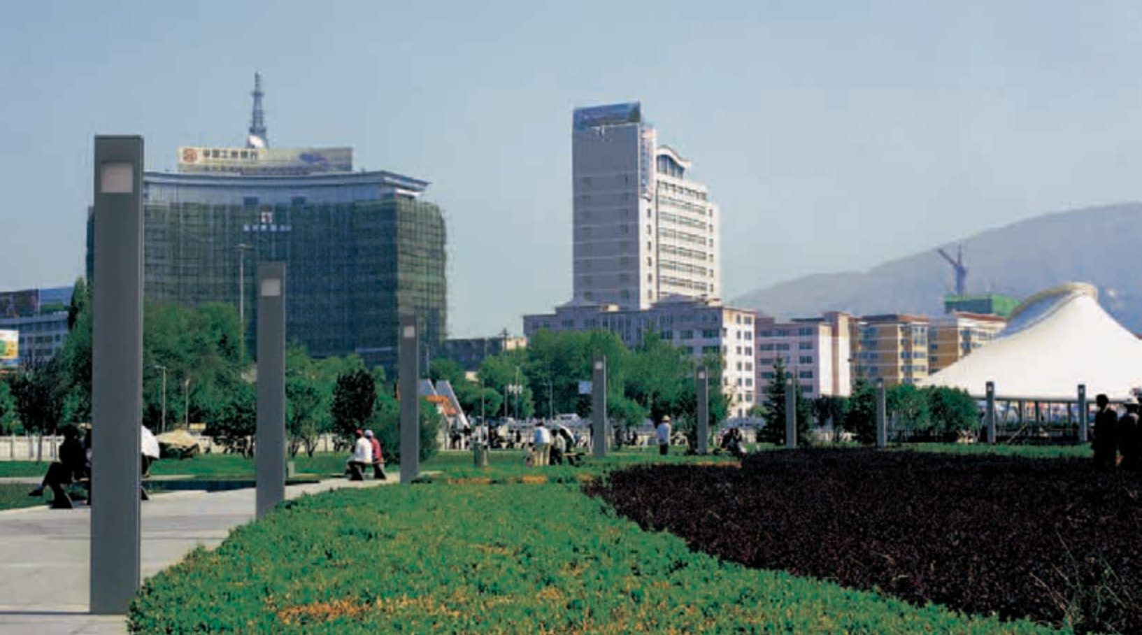
■ Xining . China ■ Xining . China